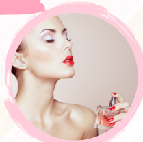
SCENTRE SHOP B2-19 20% OFF selected items