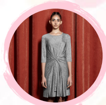
THE RECKLESS SHOP 02-32 10% OFF selected items