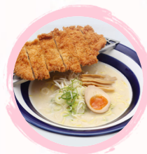
RAMEN & TONKATSU MA MAISON B1-51 10% OFF