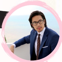
CYC MADE TO MEASURE 02-11/12 10% OFF regular priced items