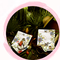
VILLEROY & BOCH 01-74/76 20% OFF selected items