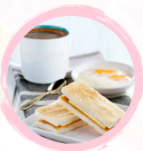
1933 BY TOAST BOX 01-83 10% OFF ala carte orders only