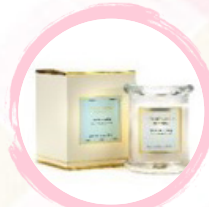
TO BE CALM B1-16 15% OFF Candles and Reed Diffusers