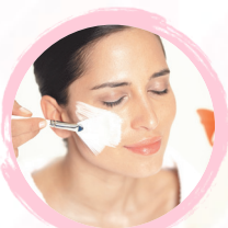
L'ESSENZA 02-30 15% OFF first trial