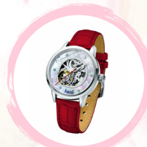
TIME INDEX B2-27 20% OFF selected items