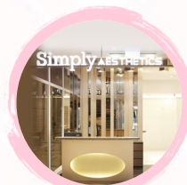
SIMPLY AESTHETICS B1-28 20% OFF *Appointment required