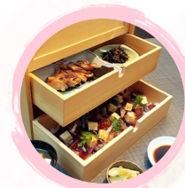
RYU'S JAPANESE RESTAURANT & SAKE BAR 01-87 10% OFF