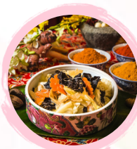
PLAYGROUND CAFÉ, BAR & BISTRO 01-85 10% OFF