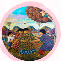
EAGLE'S EYE ART GALLERY 01-60 15% OFF selected items