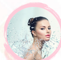
TRUE HARMONY B2-38/39 20% OFF selected treatments